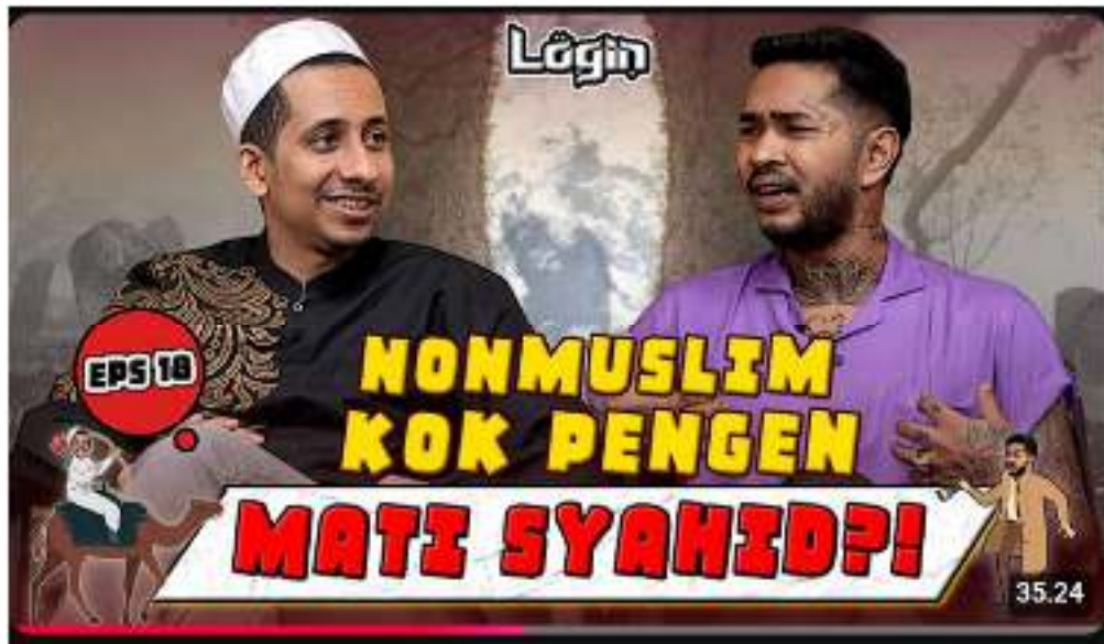
YouTube Log In Episode 18 Thumbnail 1

The concept of jihad often becomes a controversial topic due to widespread misunderstandings in society (Darmawan, 2018). In many cases, jihad is associated with violence, warfare, or acts of extremism, largely influenced by unbalanced reporting and negative narratives in social media (Zaduqisti, 2019). However, in Islamic teachings, jihad carries a broader and more positive meaning, referring to struggles in various aspects of life to achieve goodness and justice (Khairah, 2008; Sudianto, 2018; Naya, 2015). This challenge calls for digital da'wah to serve as an educational tool (Rumata et al., 2021), not only introducing the true meaning of jihad but also correcting the public's misconceptions (Wahyudi, 2021).