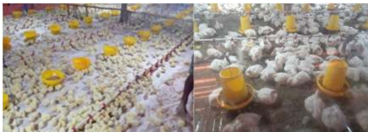
Figure 2. Feeding Broilers

Based on the observation results, it is known that broilers are kept for 36 days. Broiler feed intake during one maintenance period is an average of 3,532 grams/head. The feeding method is carried out by ad libitum and restriction. The feeding in the starter and finisher phases in the broiler is as follows: