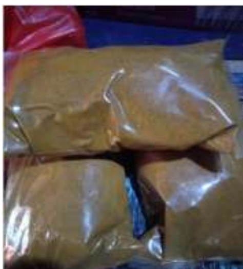
Figure 1. Turmeric Used As a Feed Additive Broiler